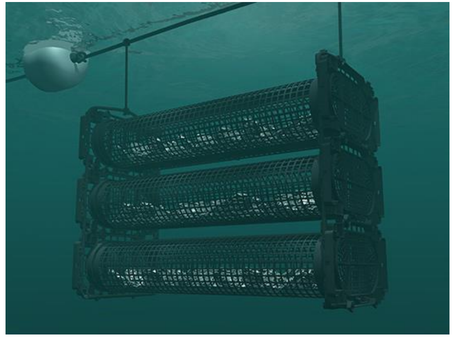
Figure 3. Stacked oyster baskets hanging from longline.